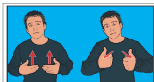
HOW ARE YOU?