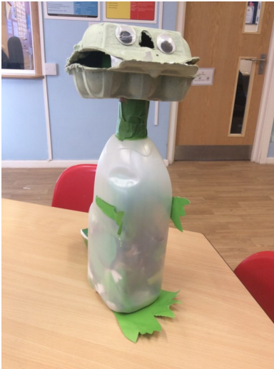
Design By Ben G — Oak