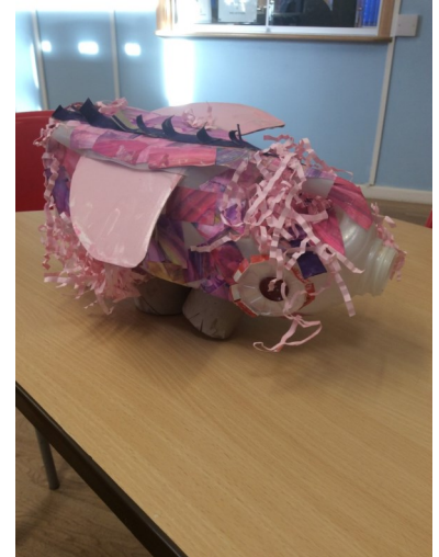
Design By Sophia L - Magnolia