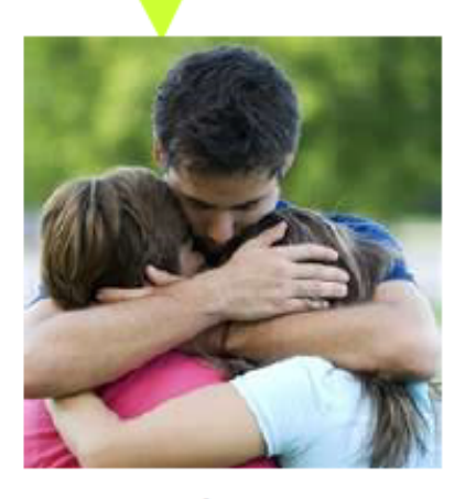
Monday evenings 7.00pm—9.00pm 4, 11, 18, 25 Nov, 2 & 9 December

A FREE 6-week course for Mums, Dads, and Carers of children 0 -19yrs